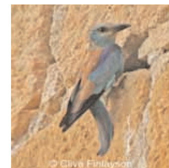
A beautiful male Montagu's Harrier and a Roller, birds for August.